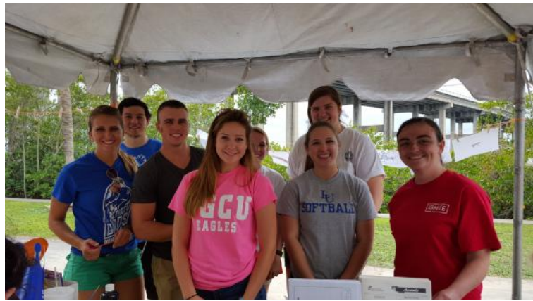
FGCU student volunteers helped at our booth at the SWFL Reading Festival