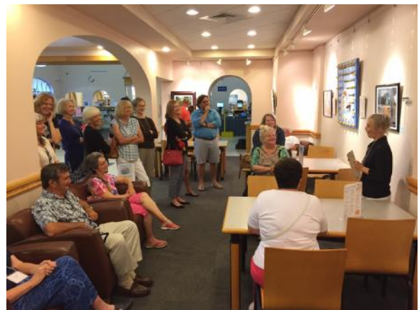
The audience enjoyed readings of poetry during the ArtPoems reception in the library gallery on April 6.